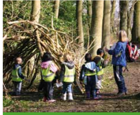
Forest Schools volunteers are needed

We are also keen to recruit volunteers to help with the delivery of our popular Forest Schools initiative. This innovative approach to education uses the natural resources