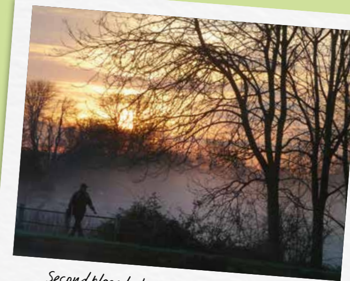
Second place last year: misty morning view towards Station Moor

With the August 11th closing date fast approaching, this is your final reminder about our annual photographic competition to find images for our 2018 calendar. Twelve images will be chosen – all photographers submitting a winning image will win a cash prize, with first place earning £100, £75 for second, £50 for third and £10 each for the other seven selected. Entry is free, and up to ten photos may be entered. All images must be taken on Box Moor Trust land, and the theme this year is, 'The Box Moor Trust: A Living Landscape'. See our website to download an entry form.