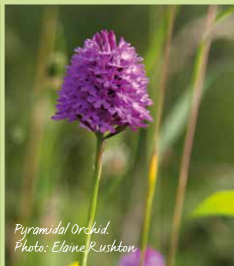
Pyramidal Orchid.