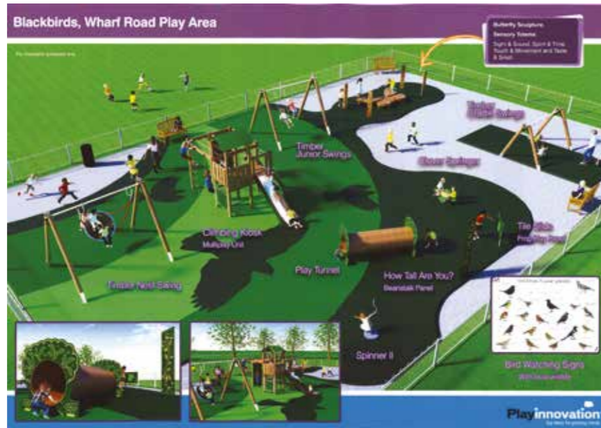
Design by Play Innovation

The life cycle of a commercially grown tree is around fifteen to twenty years. Once felled the trunks are cut into clefts, roughly 16 per tree depending on size, and sold on to bat makers. The raw clefts are then rolled out and shaved to form the bat. It takes about a year to then fully season the bat.