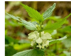
White dead nettle

Nettles have stinging hairs on their leaves to stop animals from eating them. Look out for nettle 'mimics' with similar leaves but no sting - an adaptation against being eaten.