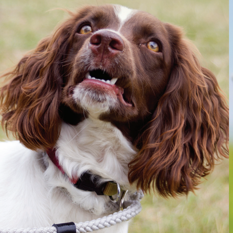
Further information for dog owners can be found at: www.gov.uk/government/publications/the-countryside-code www.nationalsheep.org.uk/dog-owners/

Thank you for being a responsible owner.